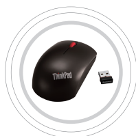
ThinkPad® Optical Wireless Mouse