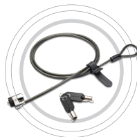
Kensington® MicroSaver Security Cable Lock from Lenovo®