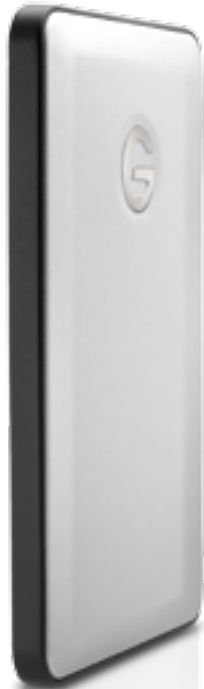
Ultra-Slim USB Drive