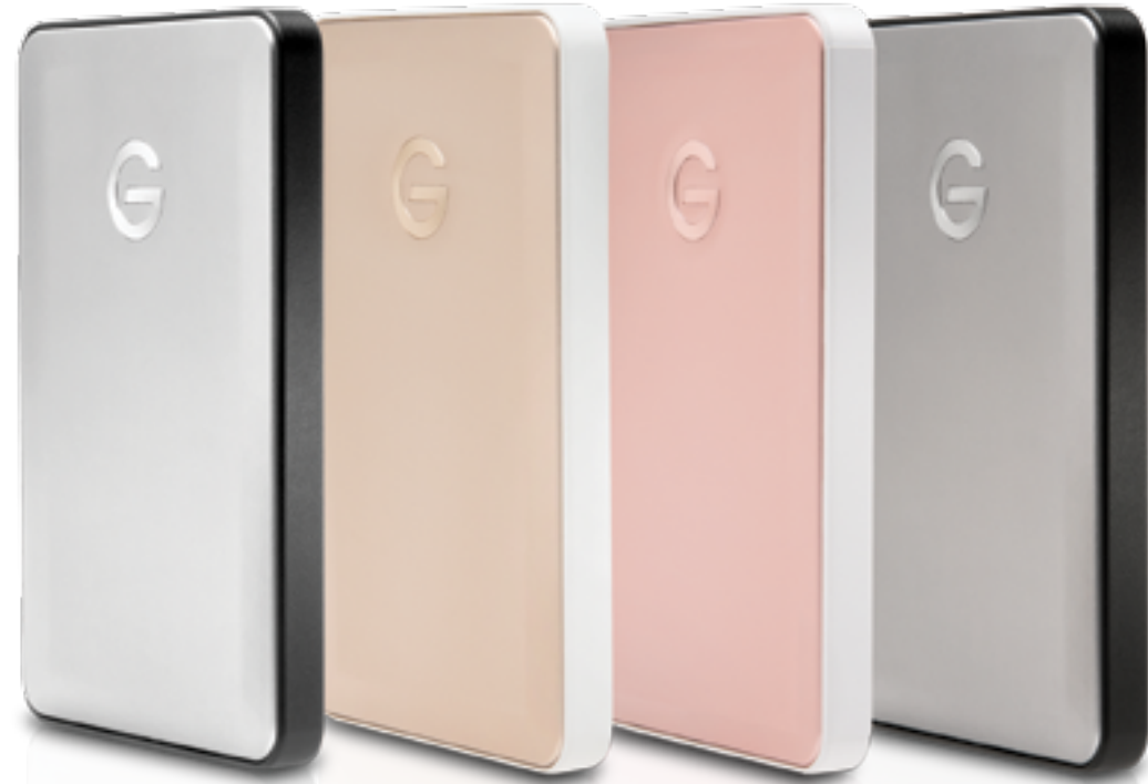
Silver Gold* Rose Gold* Space Gray*