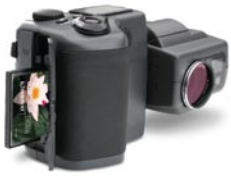
CompactFlash cards were the first small form factor Flash memory cards.